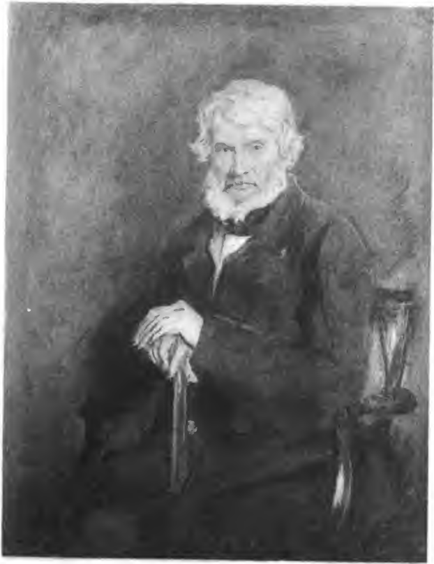
Thomas Carlyle. From the Millais portrait.